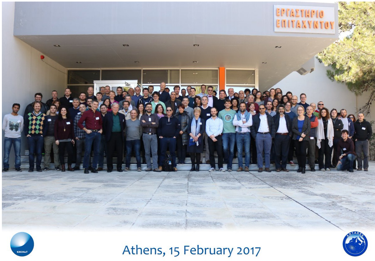
Figure 4: Participants to the Public part of the Kick-Off meeting [2]

Both the public meeting informing and discussing with the whole collaboration and the first PMB meeting contributed to a productive start of the project.